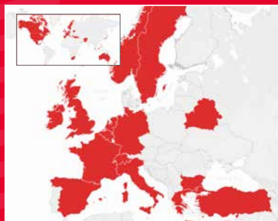
Red indicates countries where people have purchased iFollow to watch The Imps.

13,340 UK MATCH PASS SUBS 156 INTERNATIONAL SEASON PASS SUBS 289 UK SEASON PASS SUBS 2,270 INTERNATIONAL MATCH PASSES 2,652 UK MONTHLY PASS SUBS 163 INTERNATIONAL MONTHLY SUBS 984 UK AUDIO MATCH PASS SUBS